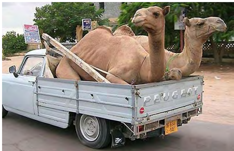
Awesome Lowered Twin Cam Ute