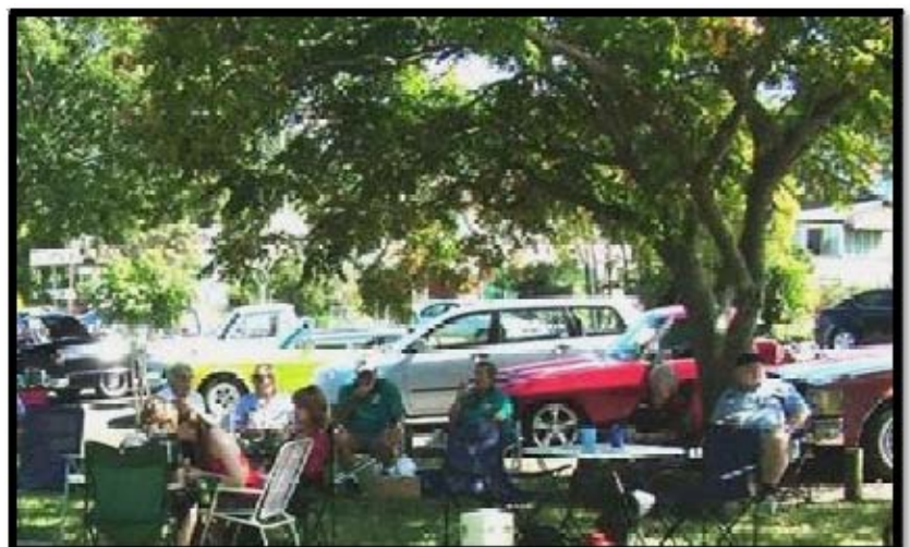
Relaxing at Yowie Park, Kilcoy