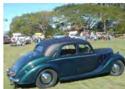
Some CHACC cars at the Bush Bash