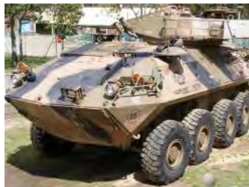
An ASLAV – Australian Light Armoured Vehicle