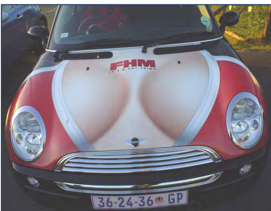
Nice Boobs 'Paint' Job