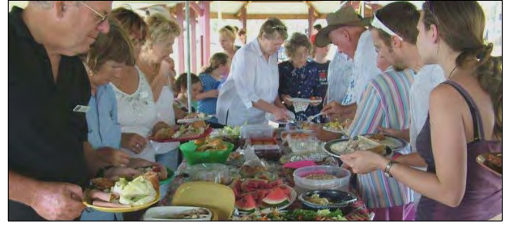
Hooking into the tucker at the Kid's Christmas Party!