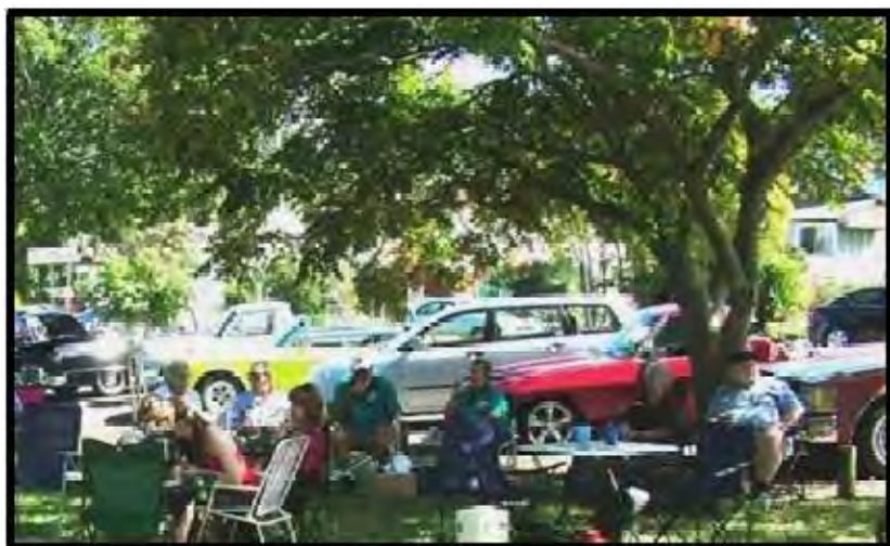
Relaxing at Yowie Park, Kilcoy