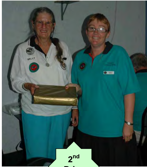
2 nd Prize