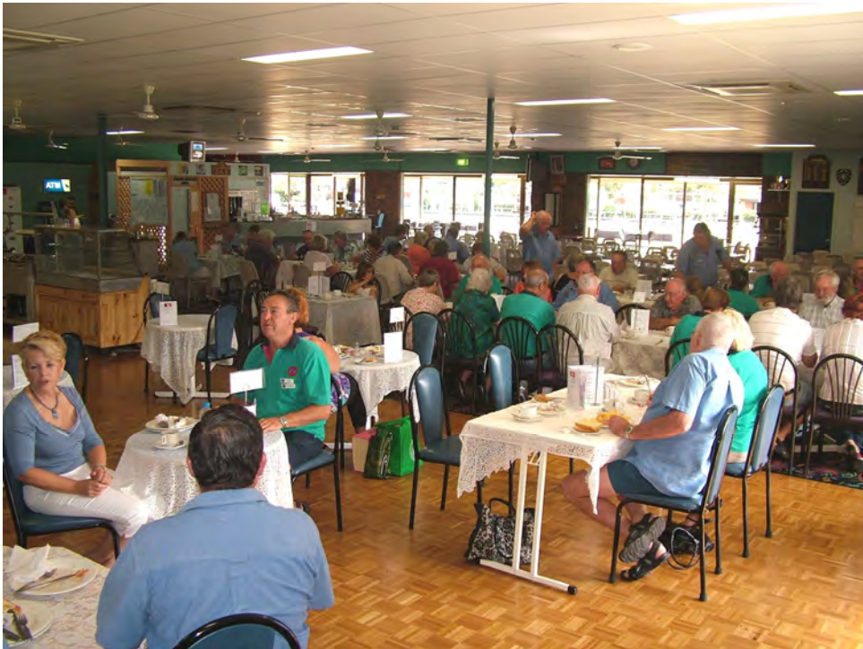
Enjoying breakfast before the AGM