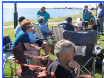
Relaxing by the foreshore at Scarborough