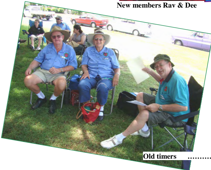
Old timers .....and very new timers