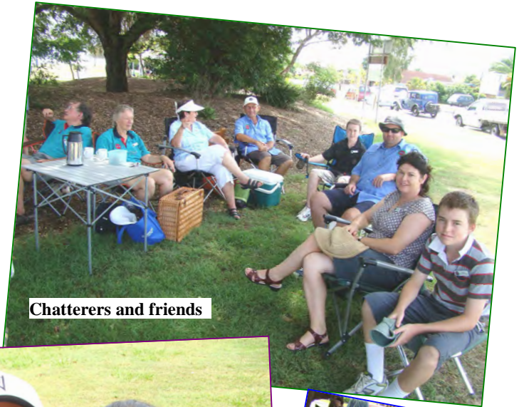
Chatterers and friends