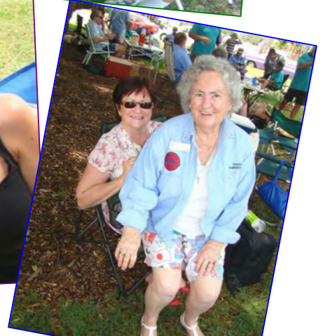
Long serving members, some showing off their knees