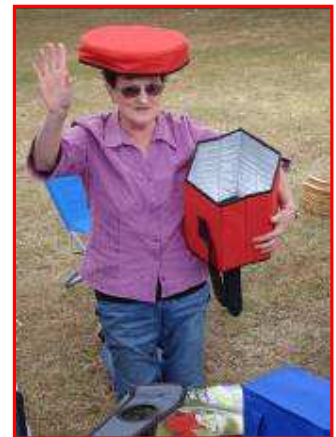
CHACC member on August mid-week run. "Where did you get that hat?"

A REMINDER: As from March this year, and in the spirit of member inclusion, the winner of the Run Raffle is expected to write a short piece on the run, for the S.C.N. It can be a long piece, or simply a few sentences.