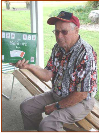
1 st Prize Raffle Winner