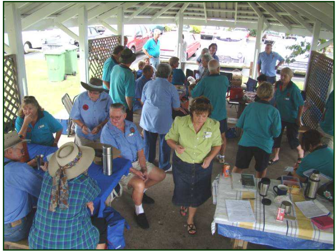
Everyone a-hustling & a-bustling