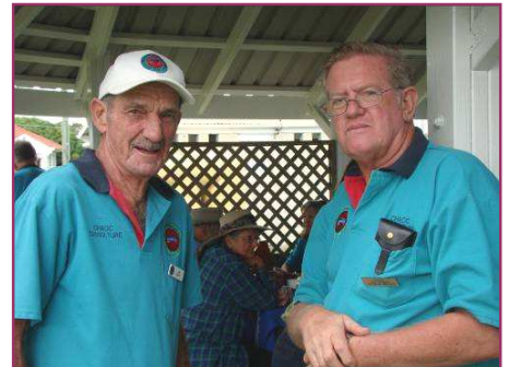
An 'anonymous' SCN contributor & an entirely innocent bystander