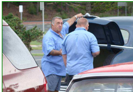
Earnest discussion (or drug dealing from the boot of the car?)