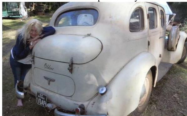
Classic and Historical Automobile Club of Caboolture Inc.