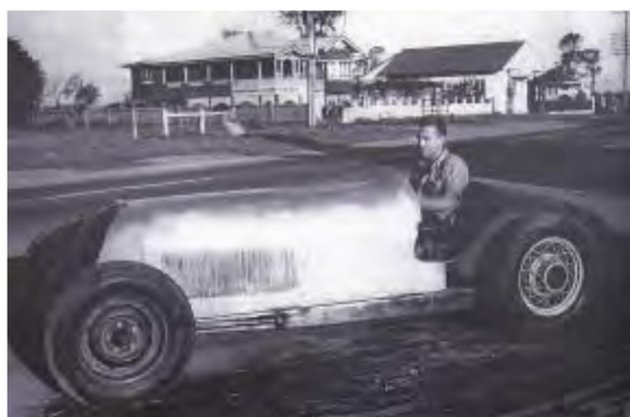
'Strathpine Special' Late 1940s Gympie Road, Strathpine