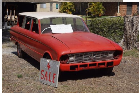
4 Sale This Car is Complete