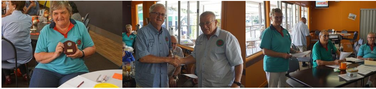
Close AGM 9.35am