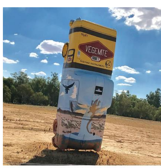
Go Vegemite 1960 FB