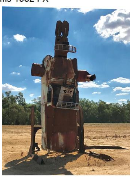
Ute Zilla 1957 FE