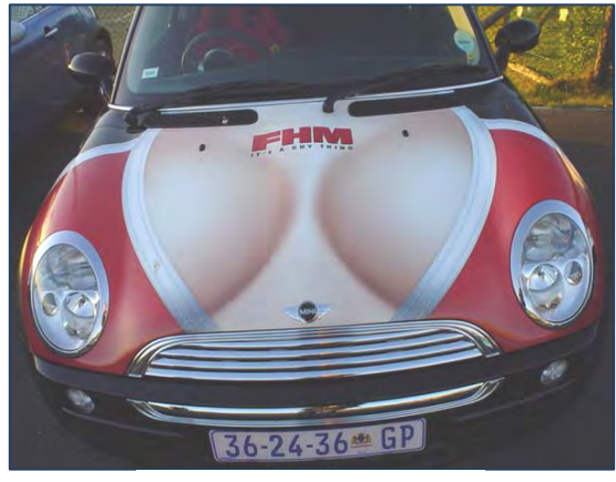
Nice Boobs 'Paint' Job

storm. The night was rolling on and no car went by. The storm was so strong he could hardly see a few feet ahead of him. Suddenly he saw a car slowly coming towards him and stopped. John, desperate for shelter and without thinking about it, got in the car and closed the door, just to realise there was nobody behind the wheel and the engine wasn't on! The car started moving slowly. John looked at the road and saw a curve approaching. Scared, he started to pray, begging for his life. Then, just before he hit the curve, a hand appeared through the window and turned the wheel. John, paralysed with terror, watched how the hand appeared every time they came to a curve. John saw the lights of a pub down the road so, gathering strength, jumped out of the car and ran to it. Wet and out of breath, he rushed inside and asked for two shots of tequila. He then started telling everybody about the horrible experience he went through. A silence enveloped everybody when they realised he was crying and....wasn't drunk. About 15 minutes later, two guys walked into the same pub. They were also wet and out of breath. Looking around and seeing John Bradford sobbing at the bar, one said to the other, "Look, Bruce..... Here's the BLOODY idiot that got in the car while we were pushing it."