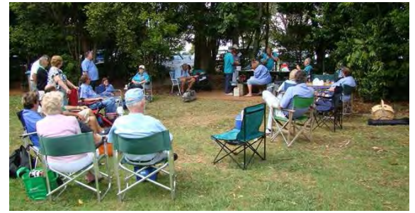
Serious bunch, aren't they?

24 members, 14 vehicles and 2 visitors in all enjoyed the beautiful spring day.