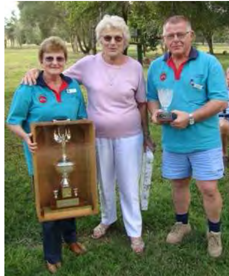
Chocolate Cake Munchers & Trophy Winners!