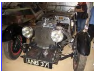
1933 Aston Martin