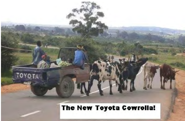
Latest Model Toyota with no accelerator problems...