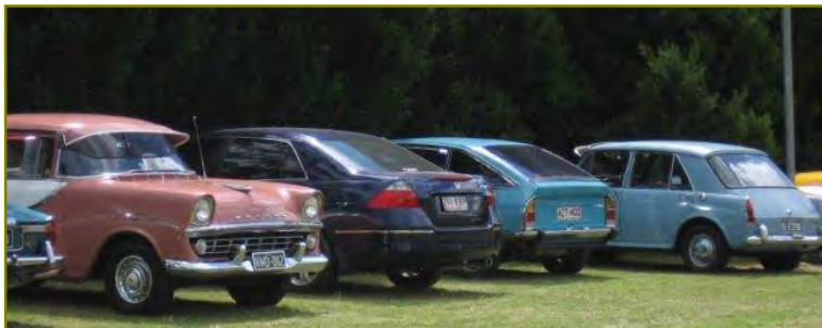
Some of the members' vehicles at Taromeo

On arriving at the Taromeo Museum we were invited to view their vehicles and machinery before we organised our BBQ lunch. All immaculately polished, amongst the highlights, an M.G.T.C., an MGB: a Morris Cooper S, a MG.B, tractors, several John Deeres, Fergies, Seagull outboard, our own Victa outboard (lawn mower relative) and down the back shed a rare Honda E type 'look-a-like'. There was also a Triumph in there somewhere!