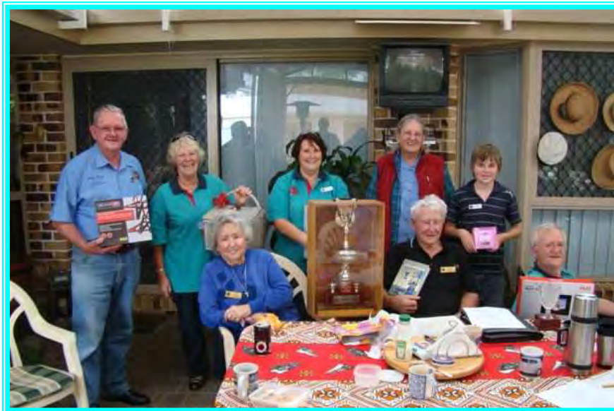
All the winners of the day!