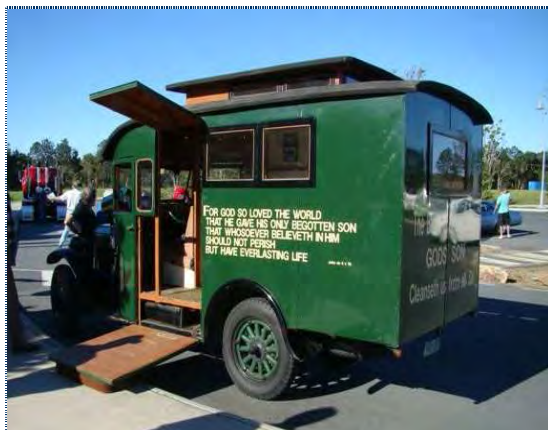
1927 Bible Preacher's Van