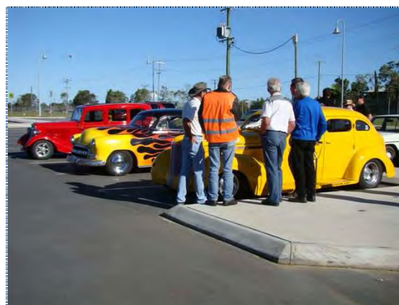
Checking out the hot rods