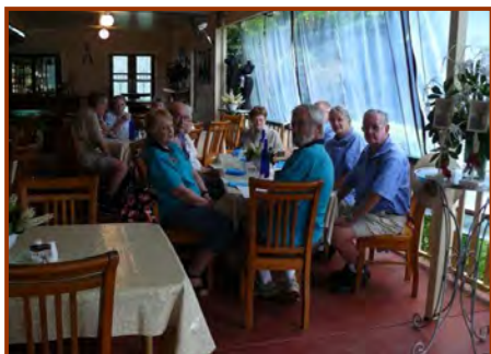
Photos from the February Mid Week Run