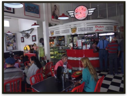
Eagle Rock Cafe