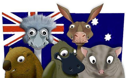
Celebrate Australia Day Australia Day - 26 January