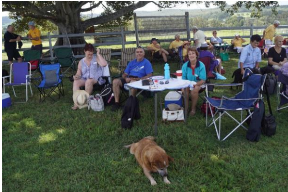
"In the lap of luxury"