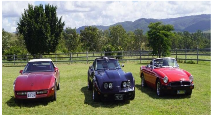
"Beauty and the Beasts"