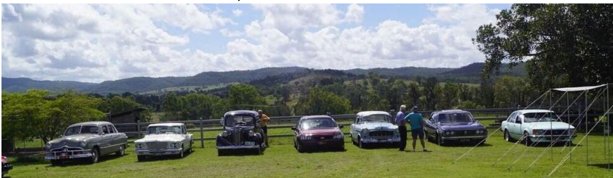
Classic and Historical Automobile Club of Caboolture Inc.