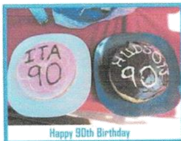
Happy 90th Birthday