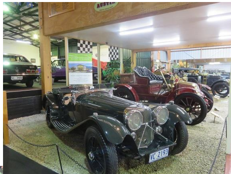
Neils & Aileen

Next time you visit Tasmania we suggest you visit the National Automotive Museum of Tasmania in Launceston. Here are just a few of the cars that were on display when we visited,