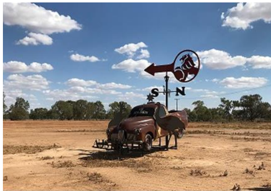
Ute of Arms 1952 FX