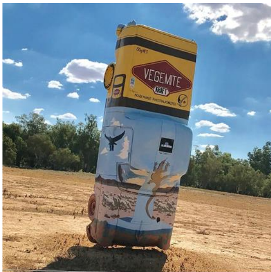
Go Vegemite 1960 FB