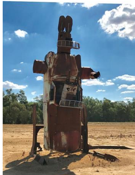
Ute Zilla 1957 FE