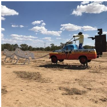
Clean Running Backed by Ned 1954 FJ