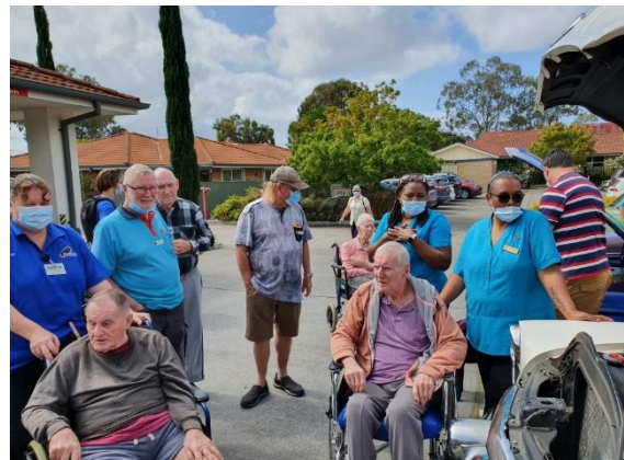
Classic and Historical Automobile Club of Caboolture Inc.