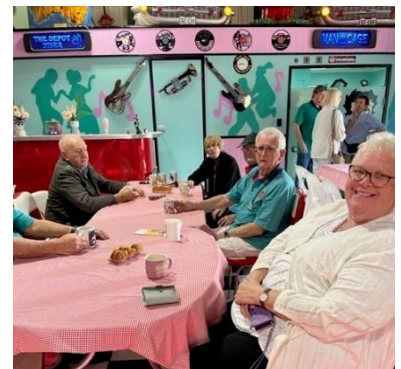
Classic and Historical Automobile Club of Caboolture Inc.