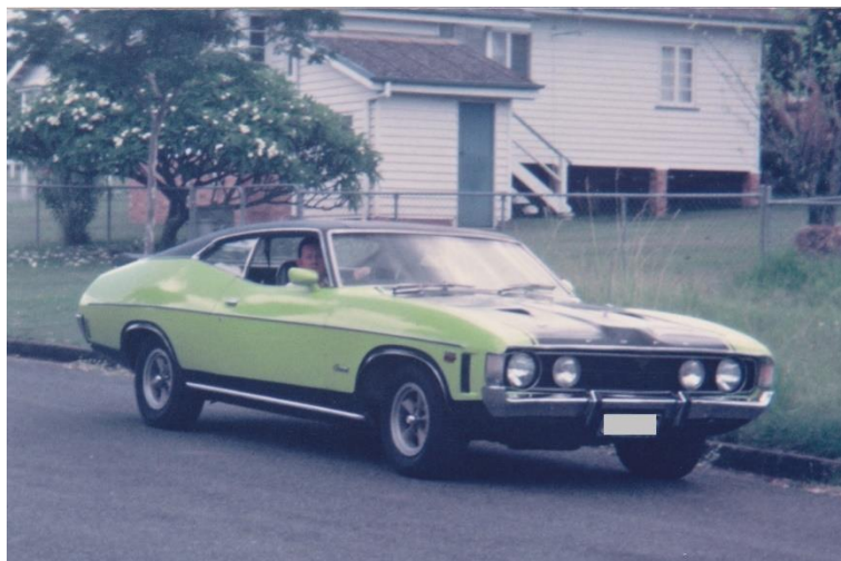
Ford Falcon XA Hardtop at Enoggera