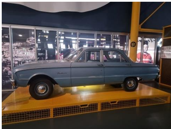
1962 XL Falcon