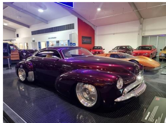
Concept Car 2005 Holden EFIJY