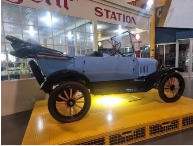
1922 Ford Model T